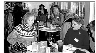
FOUCL members enjoying last year's Christmas lunch

**Special Book Exchange Instructions: The Book Exchange was a big hit last year and we will do it again—with a twist and a bit of a surprise: This time, WRAP YOUR BOOK in Christmas paper, attach a tea bag and a piece of candy and little note with good wishes for the recipient as they relax and read. EARLY ARRIVALS will get first choice of the wrapped packages—so be sure to get there early!