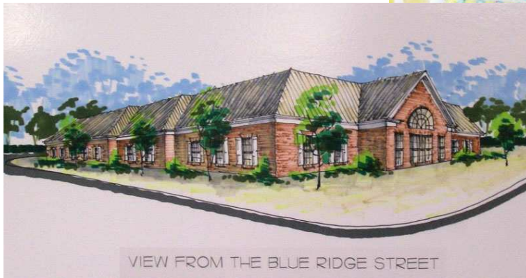
Architect's rendering of our new library addition and renovations.