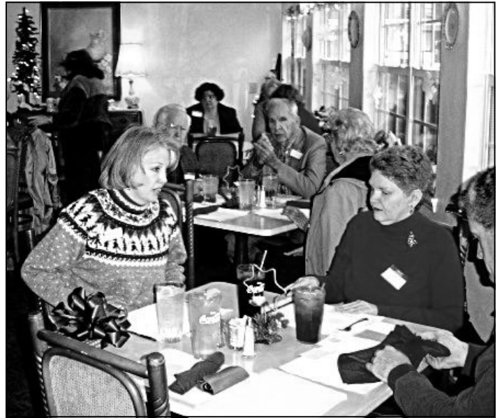
Friends of Union County Library socialize prior to the delicious meal at Cobb's Mill Restaurant in our private dining porch.