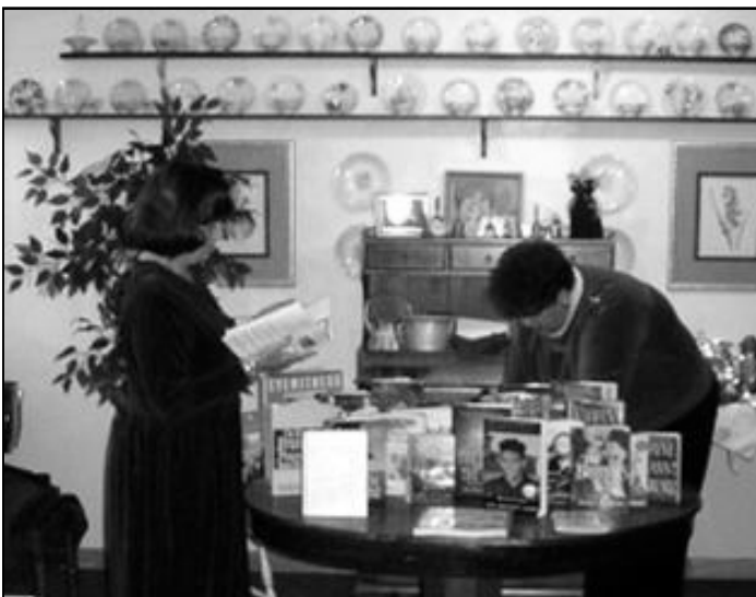
Two of the ladies attending the luncheon peruse the Book Exchange table.

Many folks lingered and talked and seemed reluctant to leave the great party. Everyone agreed that the luncheon was a big success and that they had a very good time. I know I sure did!